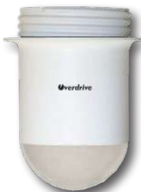
Similar size to Jelly Jar Light

Designed for Corrosive Conditions 120V IP66 Rated UL844 Hazloc Rated Class 1 Division 2 Explosion Proof Rated