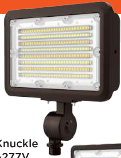
1/2" Knuckle 120-277V