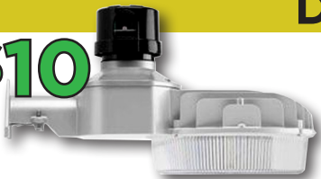
Photo Cell Included

71333C - 36/48/60W, 3/4/5K, 7750L $10 110b + 86 Multi-Watt Multi-Color